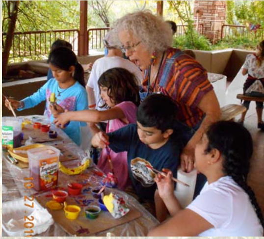
"When we mixed the colors together to make the color wheel, I learned a lot about how colors are made."